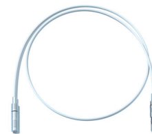
Easy Click Transfer Tube