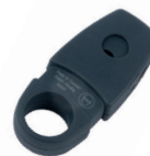
Cutter for Flexible Catheter