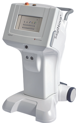
Eckert & Ziegler BEBIG SagiNova® afterloader