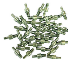
Template Needle Collets